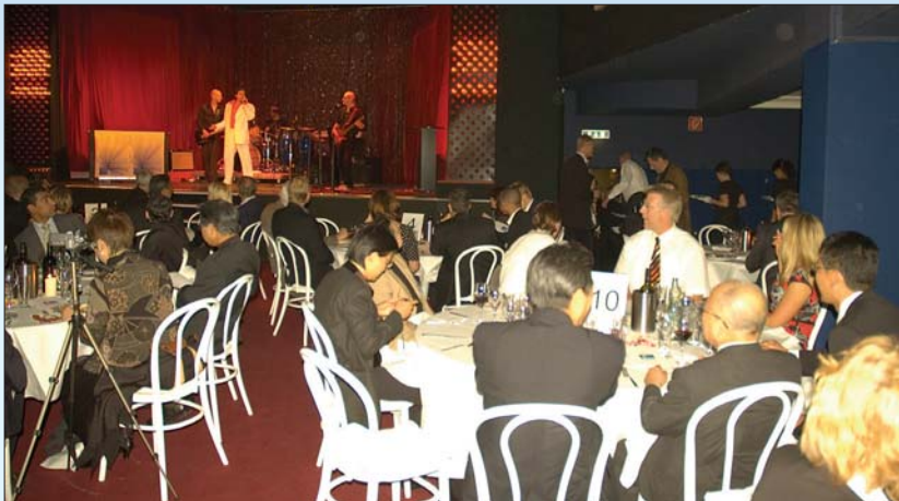
▲ Dinner and entertainment at the award presentation night.