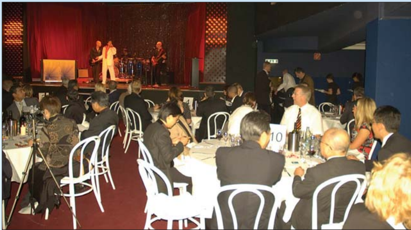
▲ Dinner and entertainment at the award presentation night.